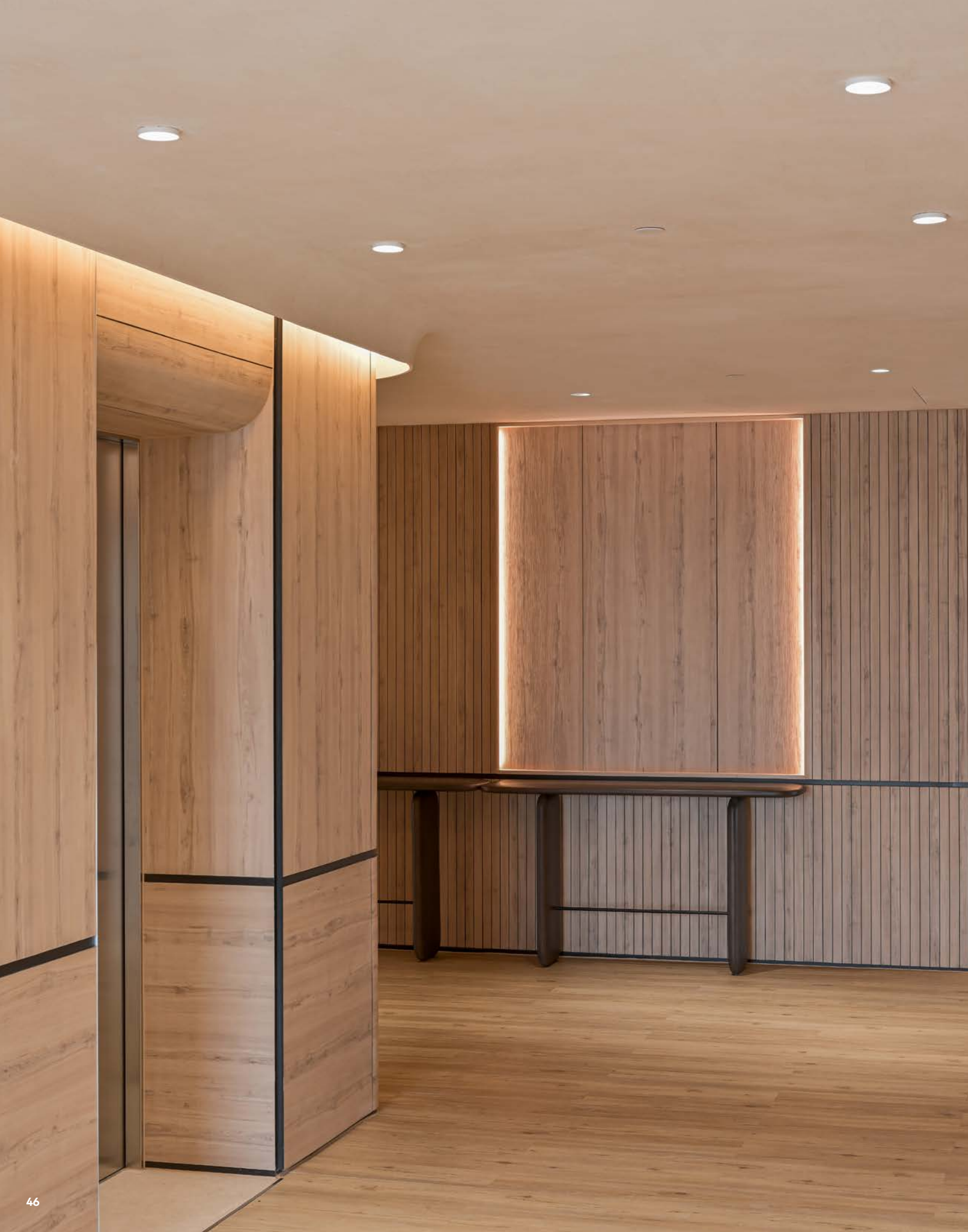
Titanium Semi Recessed