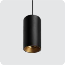
Titanium G2 Suspended Downlight Medium (215mm) Textured White Newtecons Tower